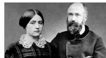
Blessed Zelig and Louis Martin, parents of St. Therese of Lisieux Beatified October 19, 2008, at the Cathedral of Lisieux

On another subject, Families are much in the news these days. Here are a couple you want to get to know who have newly been named as "Blessed," the step before Sainthood in the Catholic Church.