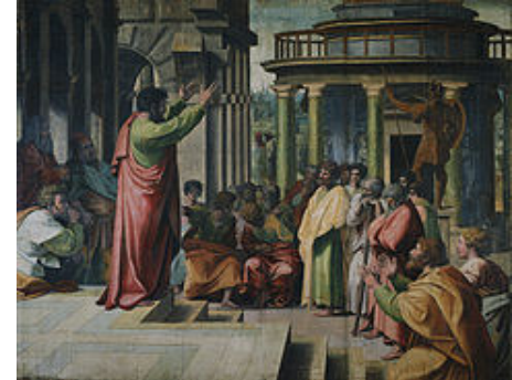
Corinth – Acts 18 I-II Corinthians