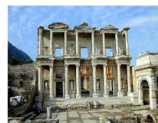
Ephesus – Rev. 2:1-7

This morning we will arrive to the island of Rhodes which is characterized as the “Jewel” of the Dodecanese islands. It enjoys an exceptionally mild climate and receives by far the lion’s share of visitors. It combines all that is needed in a holiday island; beaches, nightlife, culture, scenery, greenery and comfort. The medieval Old Town of the City of Rhodes have been declared a World Heritage Site. Here you will may wish to visit the island on your own or take one of several optional excursions. (B/L/D)