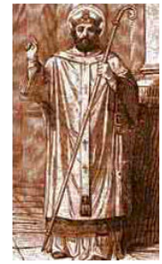
Crete – Acts 27:13ff Letter to Titus